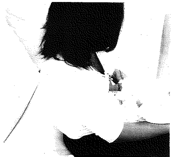
SEORANG perempuan migran yang memilih melahirkan bayinya di Hong

Hanya saja, ia belum berani mengatakan kondisinya pada orang tuanya di rumah. "Tbu saya punya sakit jantung. Saya belum siap memberitahu sekarang. Mungkin nanti kalau (bayi) sudah lahir, saya baru berani ngomong," ungkap