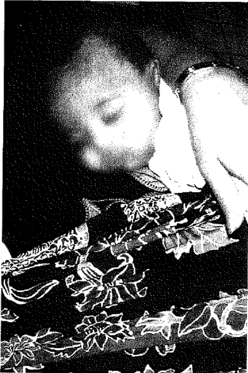
Ada yang mengirim bayinya pulang, ada yang memutuskan diadopsi

Some babies were brought home (Indonesia), some babies for adoption (In HK)