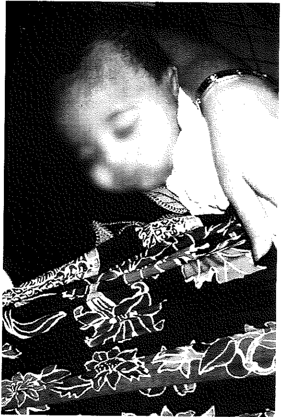
Ada yang mengirim bayinya pulang, ada yang memutuskan diadopsi

Setelah status hukumnya jelas maka tahapan lanjutnya bisa dipikirkan apakah ia akan memelihara sendiri anak yang dilahirkannya atau menyerahkan untuk proses adopsi. Karena rata-rata mereka masih ingin melanjutkan kerja di Hong Kong. "Semua terserah pilihan mereka," ujarnya.